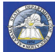
Alabama Department of Education