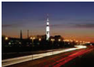
Huntsville, AL Site of 2010 Alabama Library Association Conference