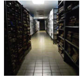
University Archives Stacks

records should reflect the activities of the league from its establishment in 1925 as the Mobile Charity League up to today. The gift of the Junior League's records further builds on the women's collections already housed at USA Archives, including those of the Woman's Clubhouse Association, the Forum Club, the Wistaria Study Club, and the Azalea City Quilter's Guild.