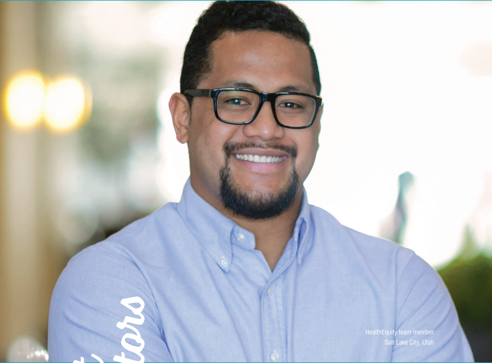
HealthEquity team member Salt Lake City, Utah